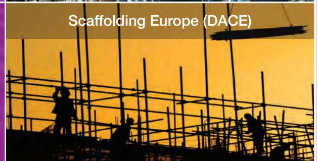
Scaffolding Europe (DACE)