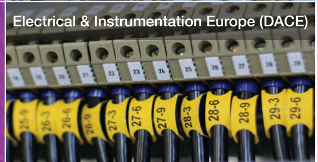
Electrical & Instrumentation Europe (DACE)