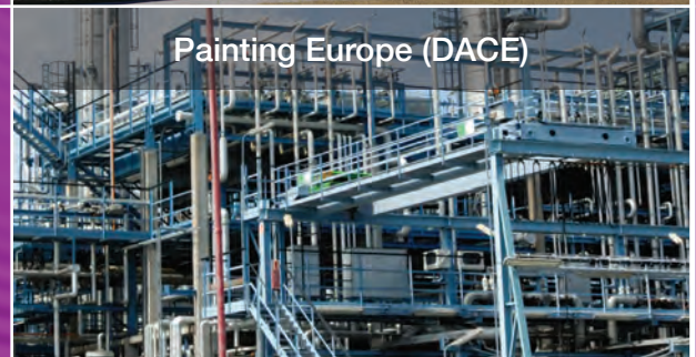
Painting Europe (DACE)