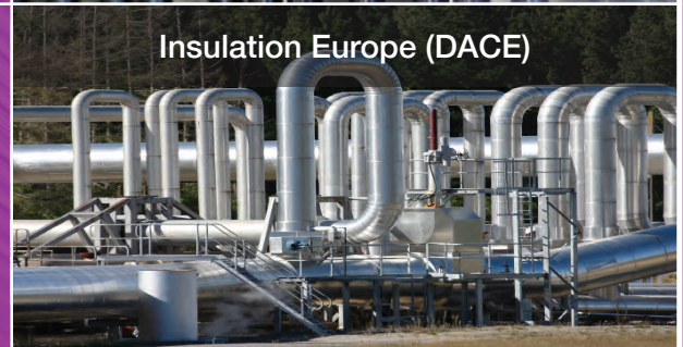
Insulation Europe (DACE)